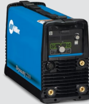
TIG Welder 907685