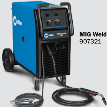
MIG Welder 907321