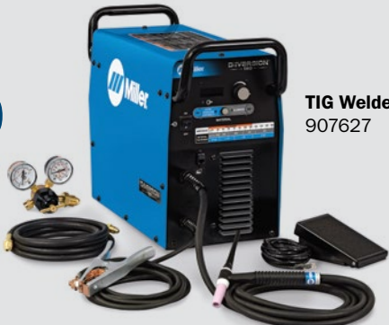
TIG Welder 907627